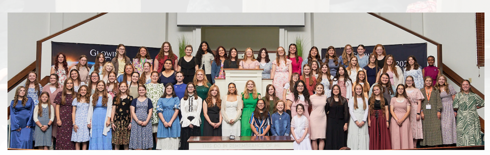
Foundations Girls Campers 2025